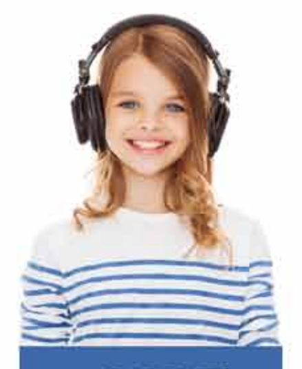
What PARENTS are saying about LifeTalk Radio:

"With 24/7 kids programming, my kids can tune in when it fits our family schedule, and as parents we can trust that what they are hearing is Christcentered and building their characters for eternity."