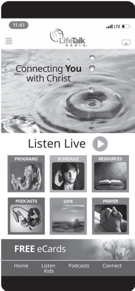
New LifeTalk APP