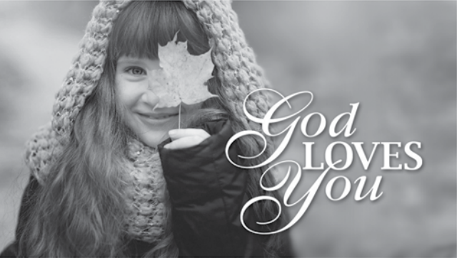
▲ Card Front Side ▼ Card Back Side

One listener said, “I enjoy handing out your sharing cards to my community. People always respond positively being affirmed of God’s love and being appreciated. Thank you LifeTalk for making the cards available.”